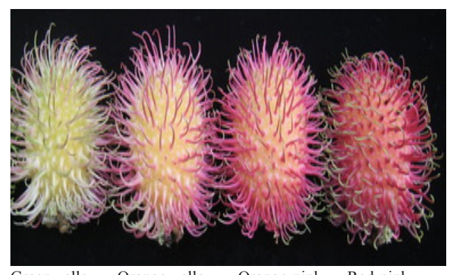
Green yellow Orange-yellow Orange-pink Red-pink Figure 1. Different maturity stages of 'Sri-Chompoo' rambutan fruit based on color development (Kosiyachinda, 1988)